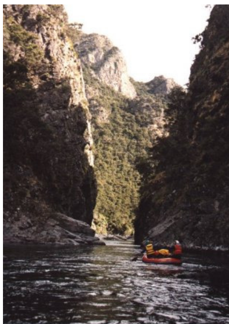
Rangitikei River headwaters North Island, NZ

The company specialises in inflatable whitewater river boats of all sizes from 2.5m up to 7.6m rafts, and various high performance kayaks and canoes 3.0m to 5.2m.